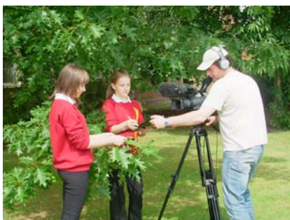
Filming the GLOBE videos and (right) a still from one of the on-line video clips

GLOBE's website now has eleven on-line videos presented by GLOBE students, showing how to carry out key GLOBE activities related to Climate Change. Each video is of one activity, presented by students from both primary and secondary schools. And there is a message of encouragement from a scientist at the Met Office's Hadley Centre for